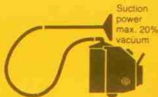
Suction power % vacuum

Industrial cleaners with blower. Field of application: Dust and dry fly.